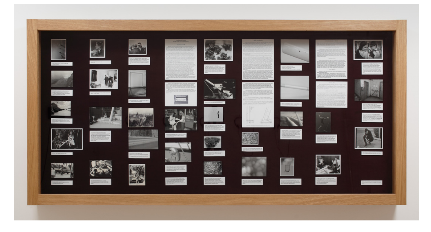
Show-case with archive photographs and text from USA, Cuba and Czechoslovakia