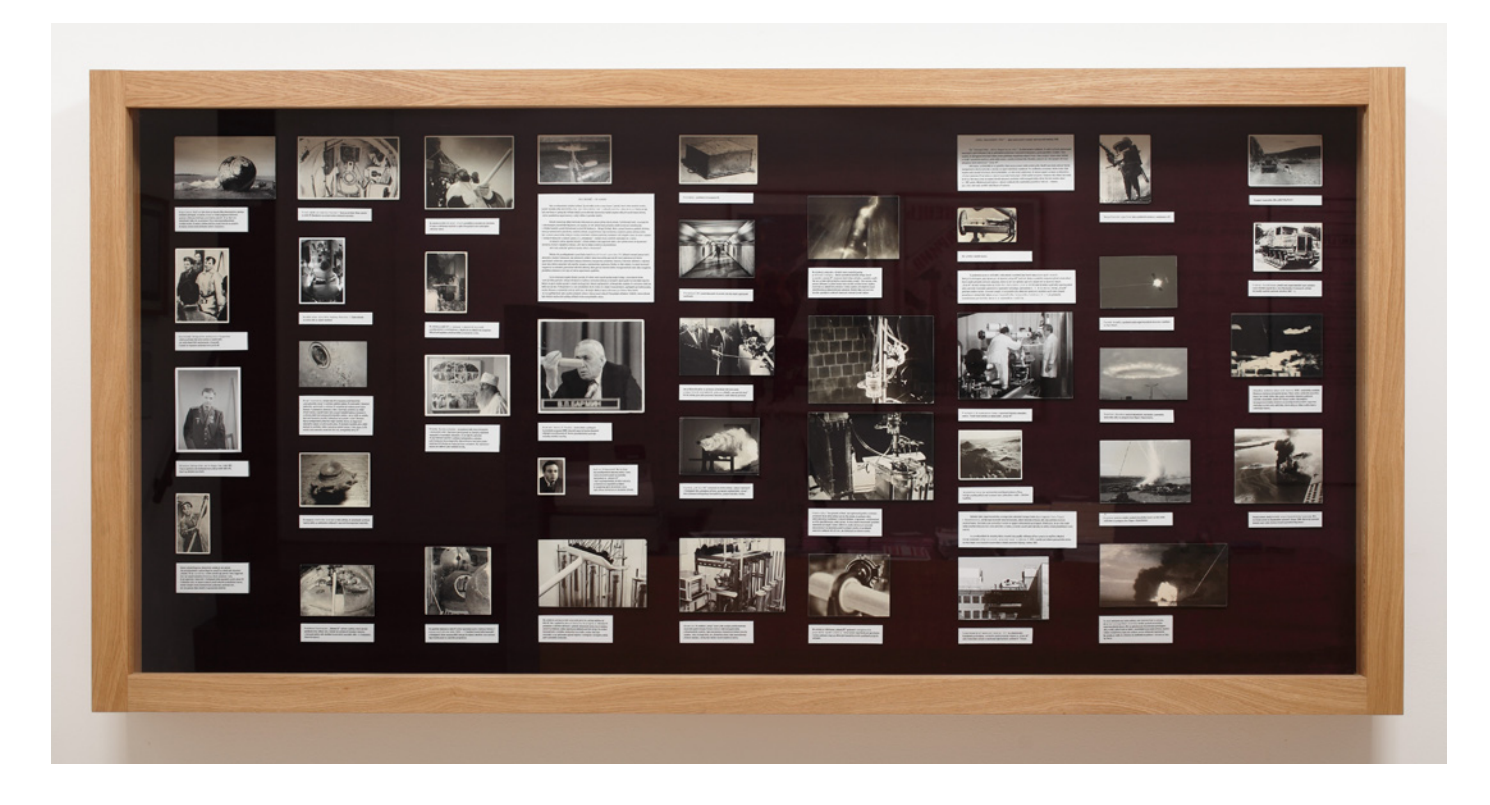
Show-case with archive photographs and text from Russia