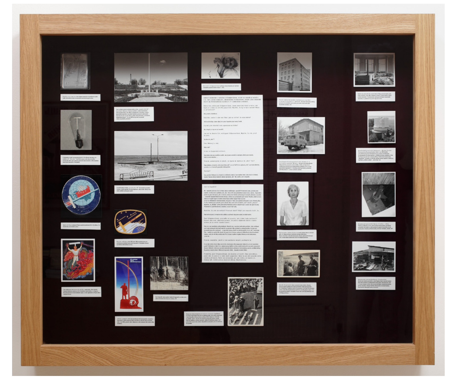
Show-case with archive photographs and text from Russia